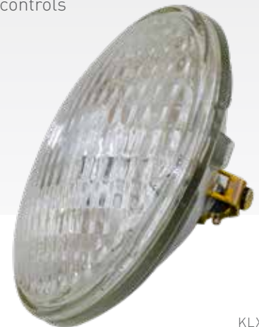
KLX - A

Contact KLX Aerospace Solutions for all of your lighting requirements at Lighting@KLX.com